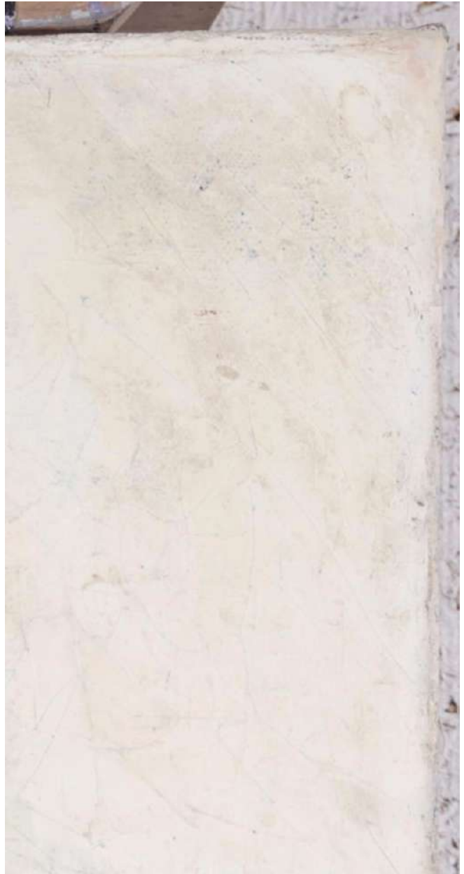
UR corner, after treatment