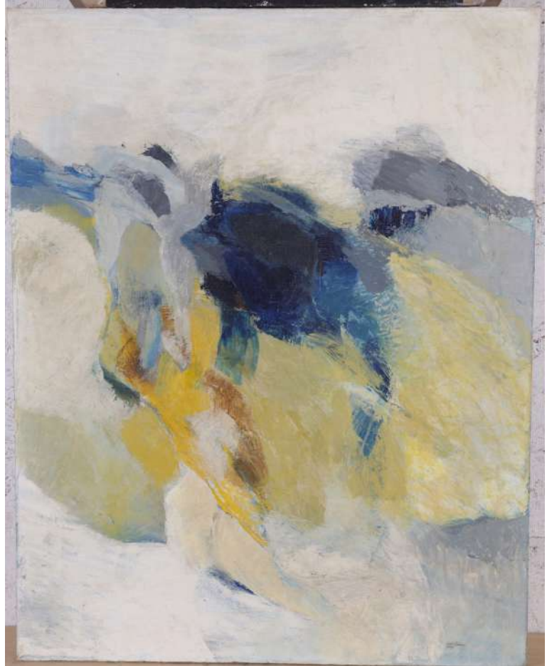
Overall, after treatment