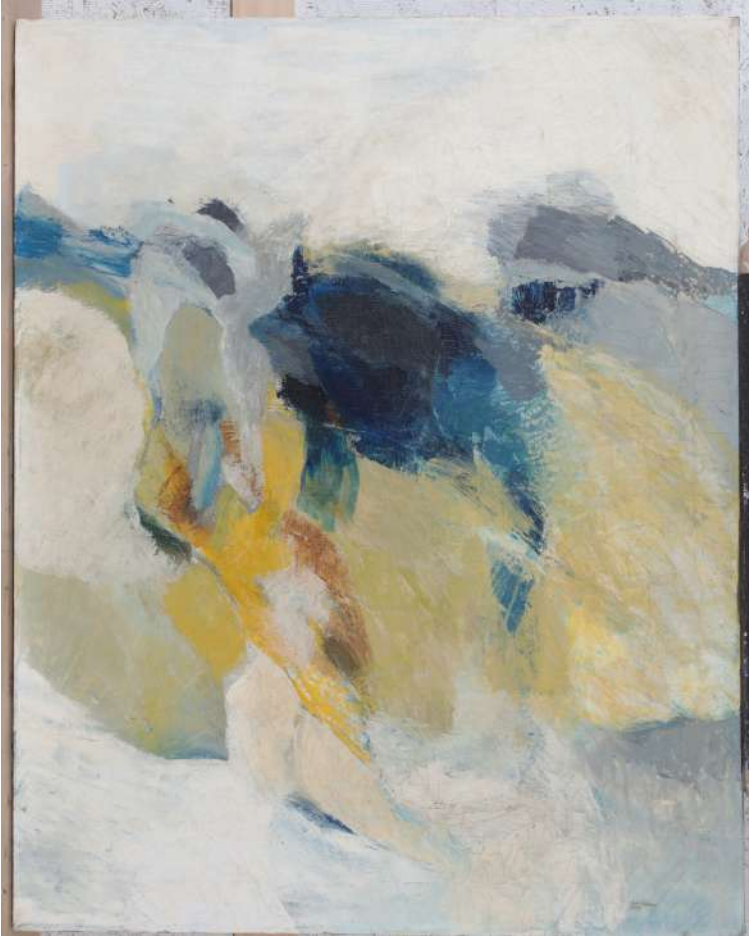
Overall, before treatment