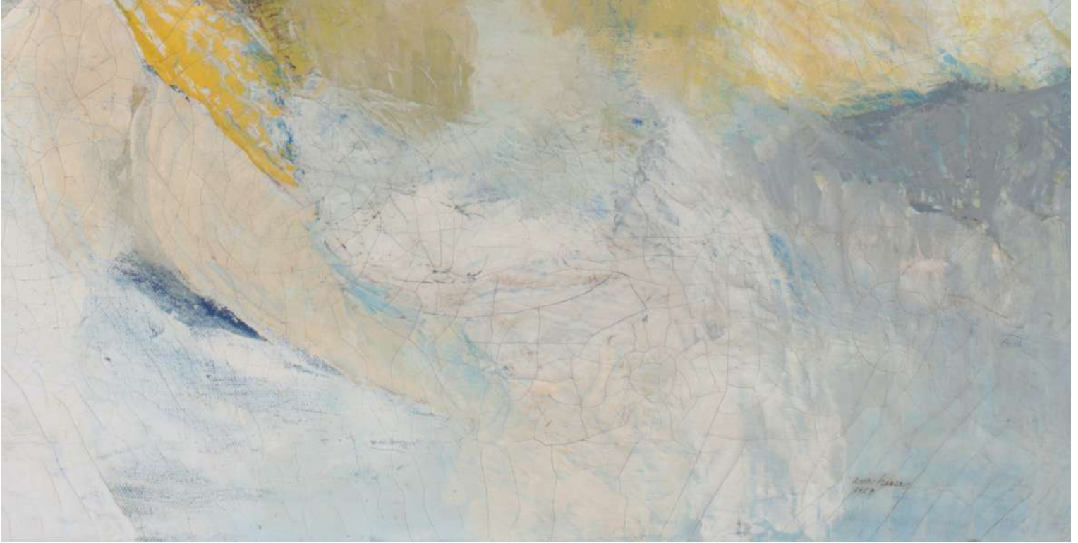
LR corner, before treatment