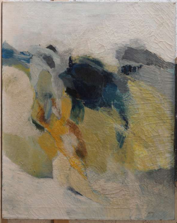
Overall, raking light, before treatment