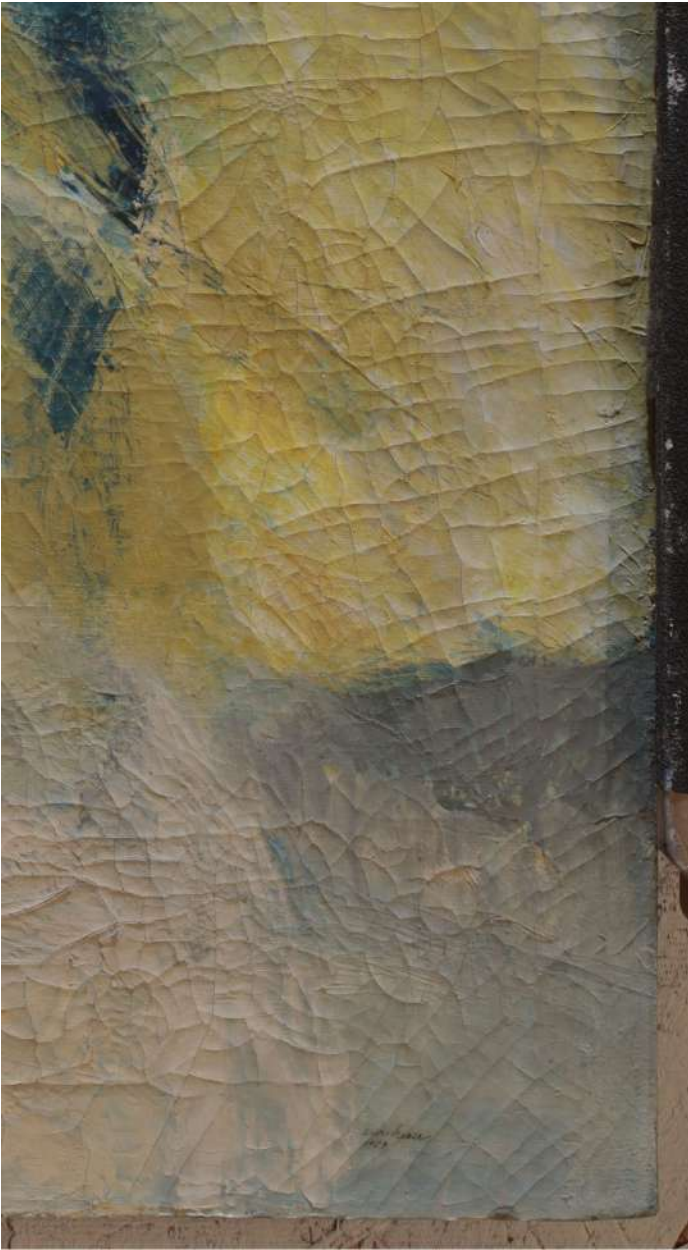
LR corner, raking light, before treatment