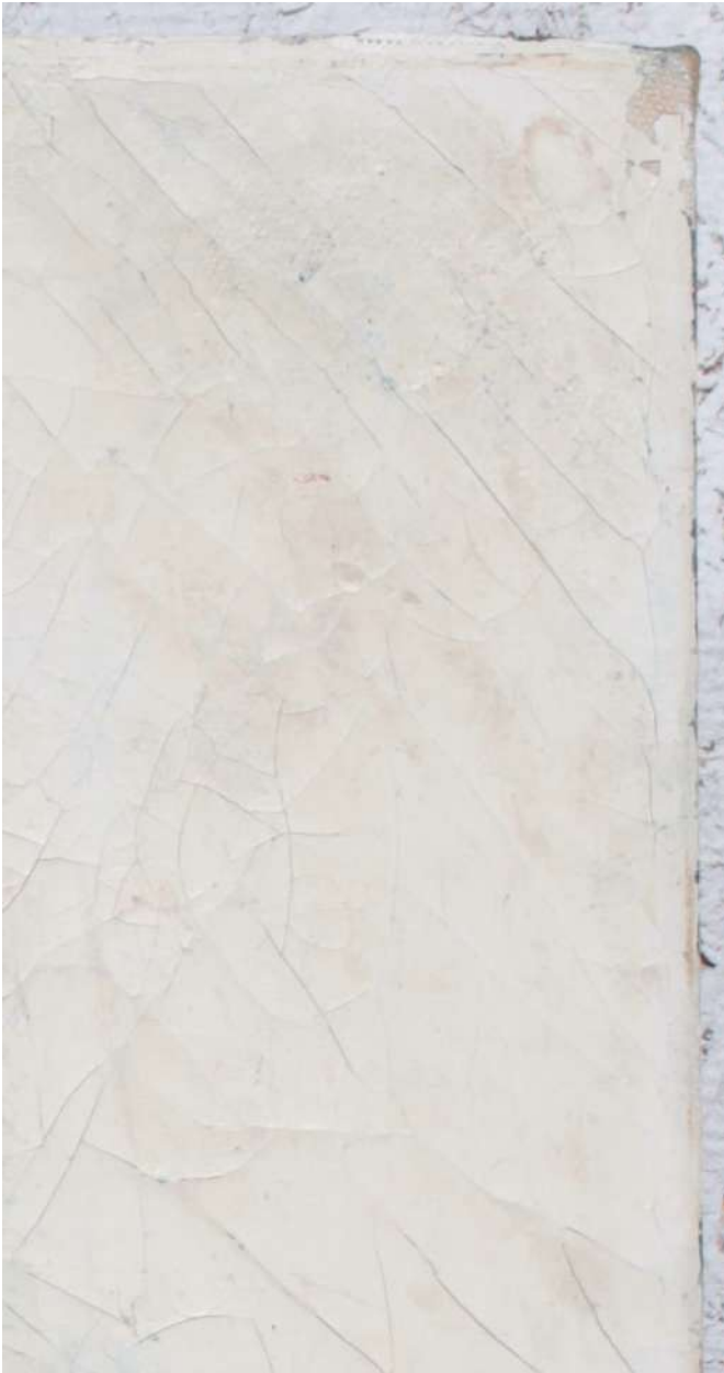
UR corner, before treatment