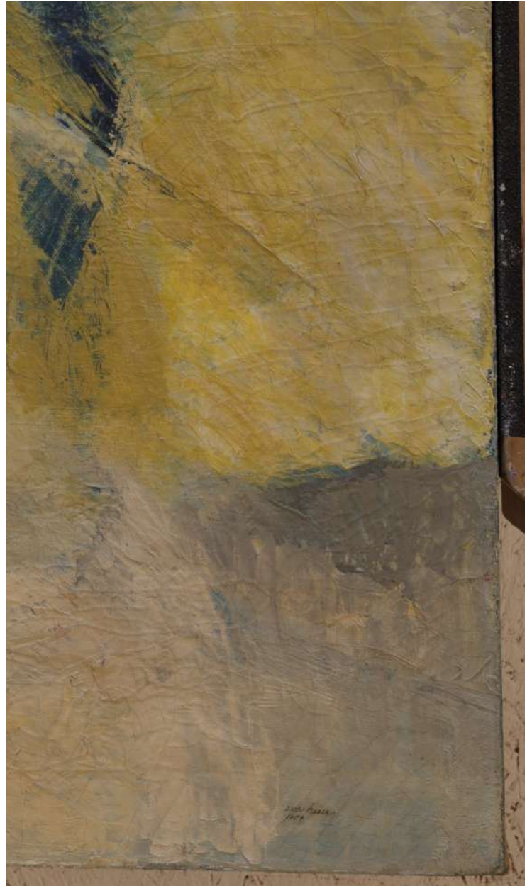
LR corner, raking light, after treatment