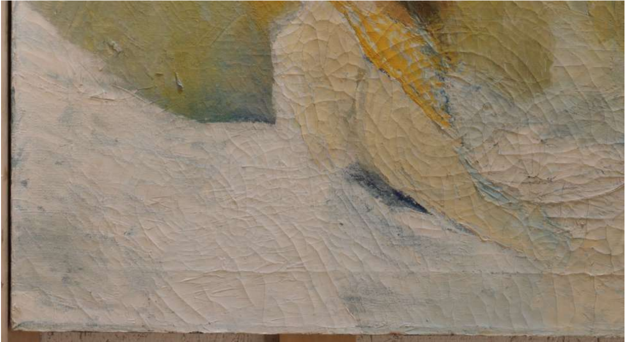
LL corner, raking light, before treatment