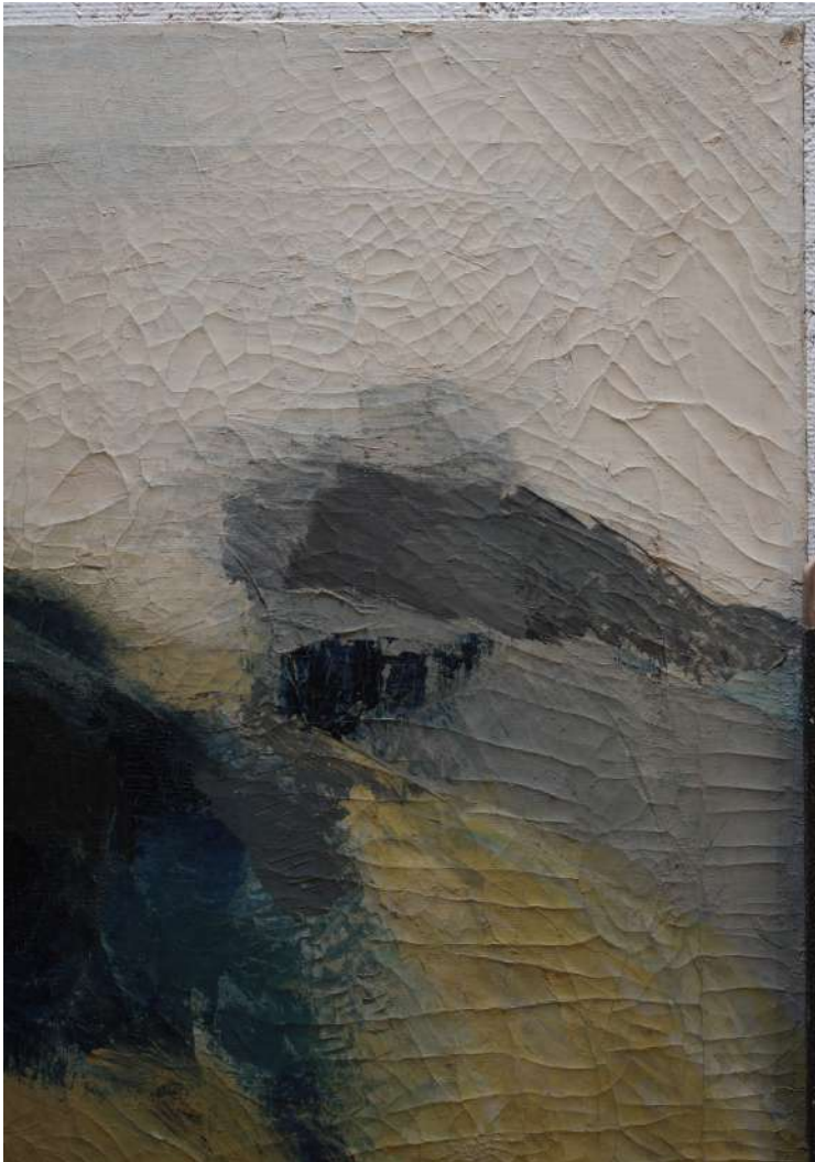
UR corner, raking light, before treatment