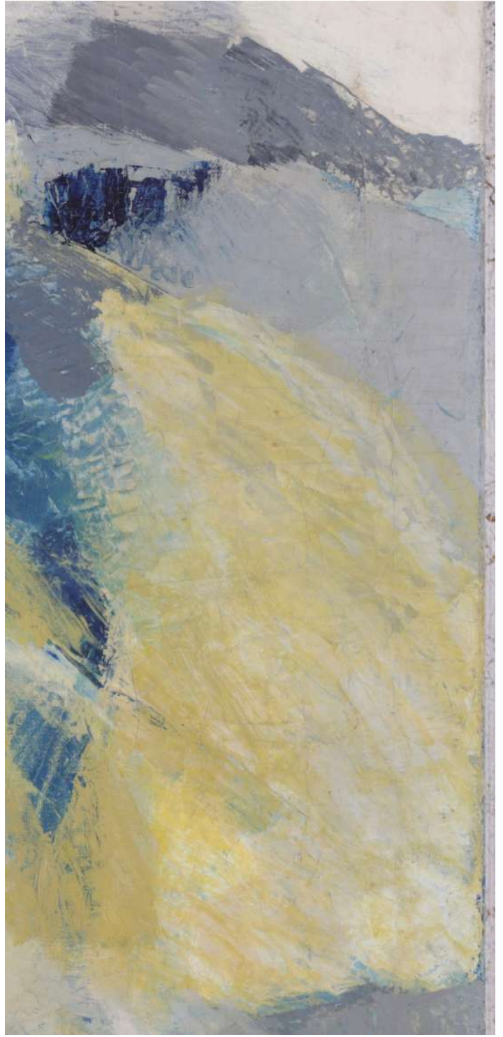
Right edge detail, after treatment