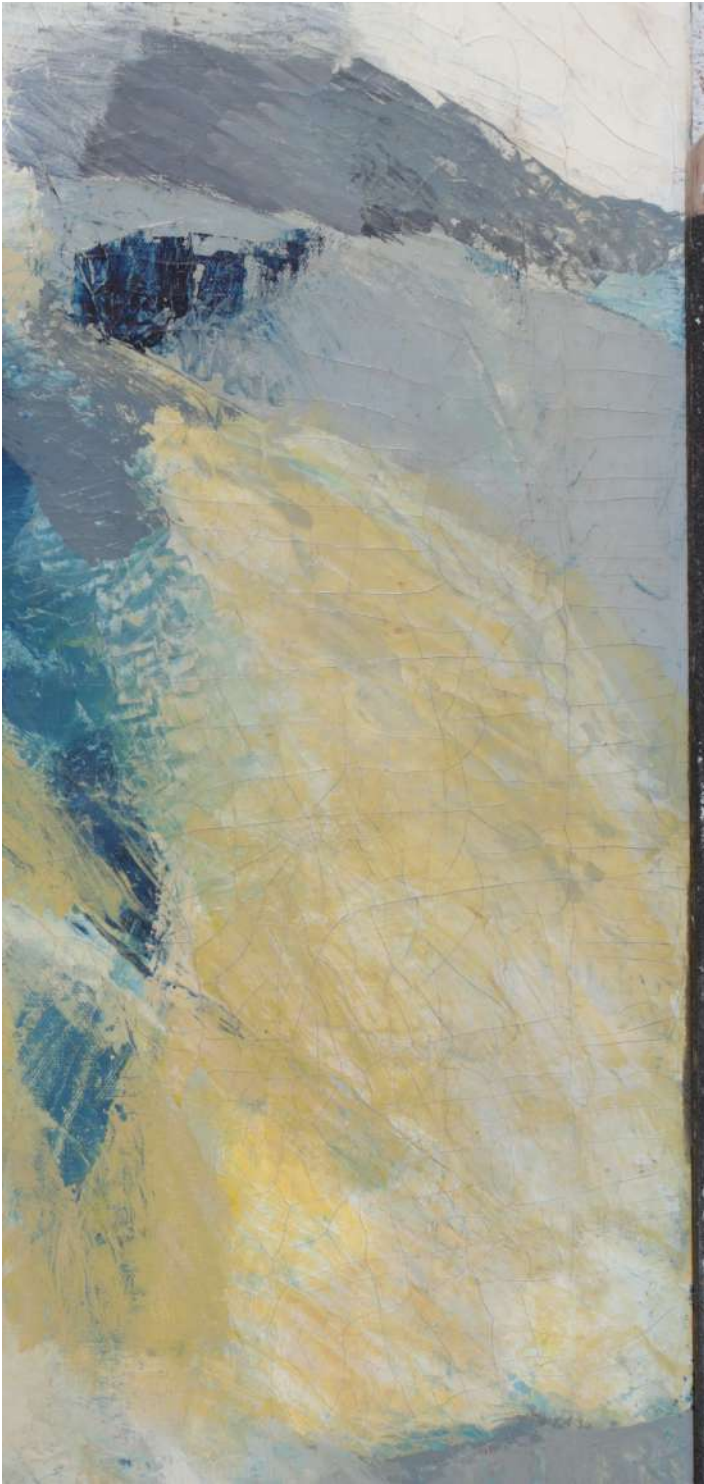
Right edge detail, before treatment