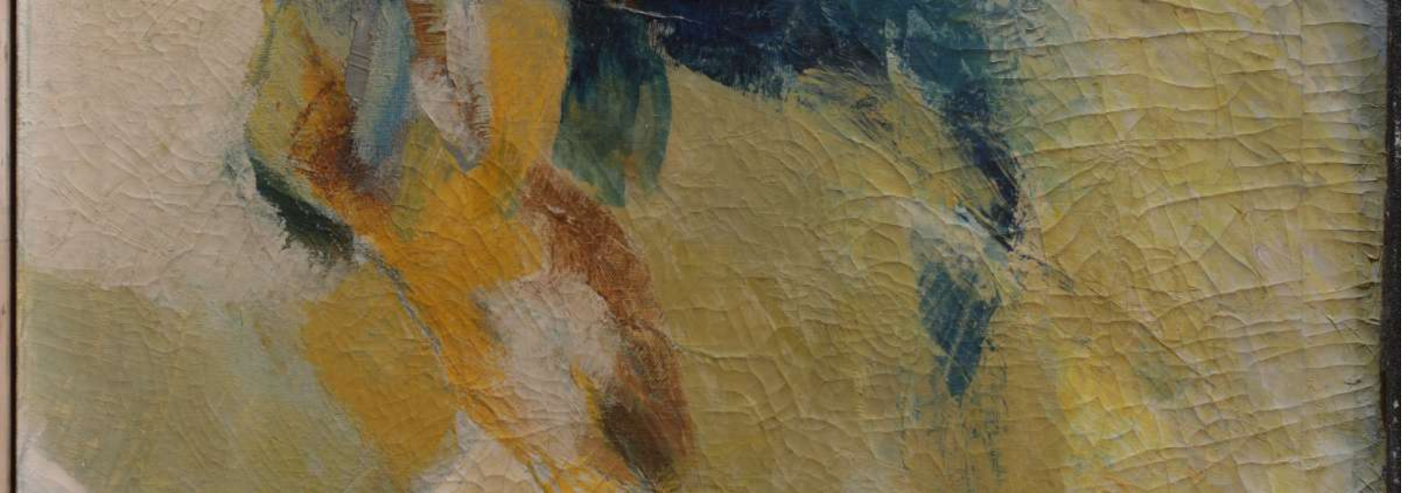
Central detail, raking light, before treatment