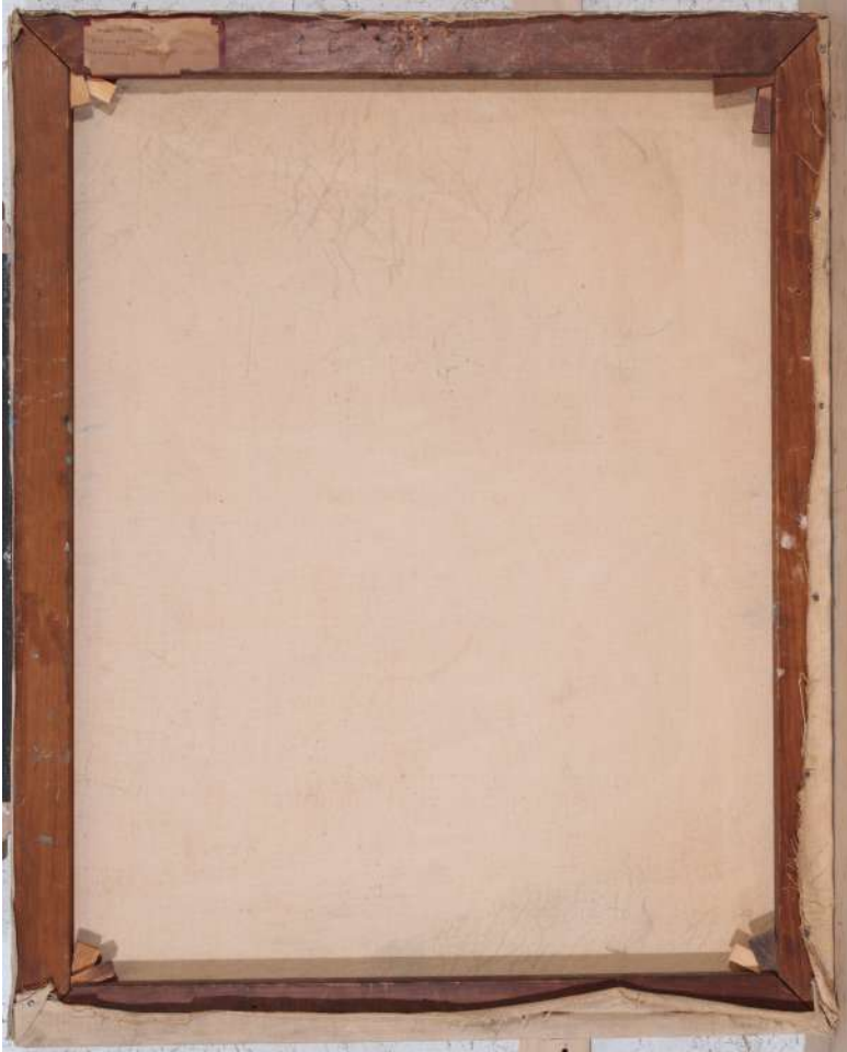
Verso, before treatment