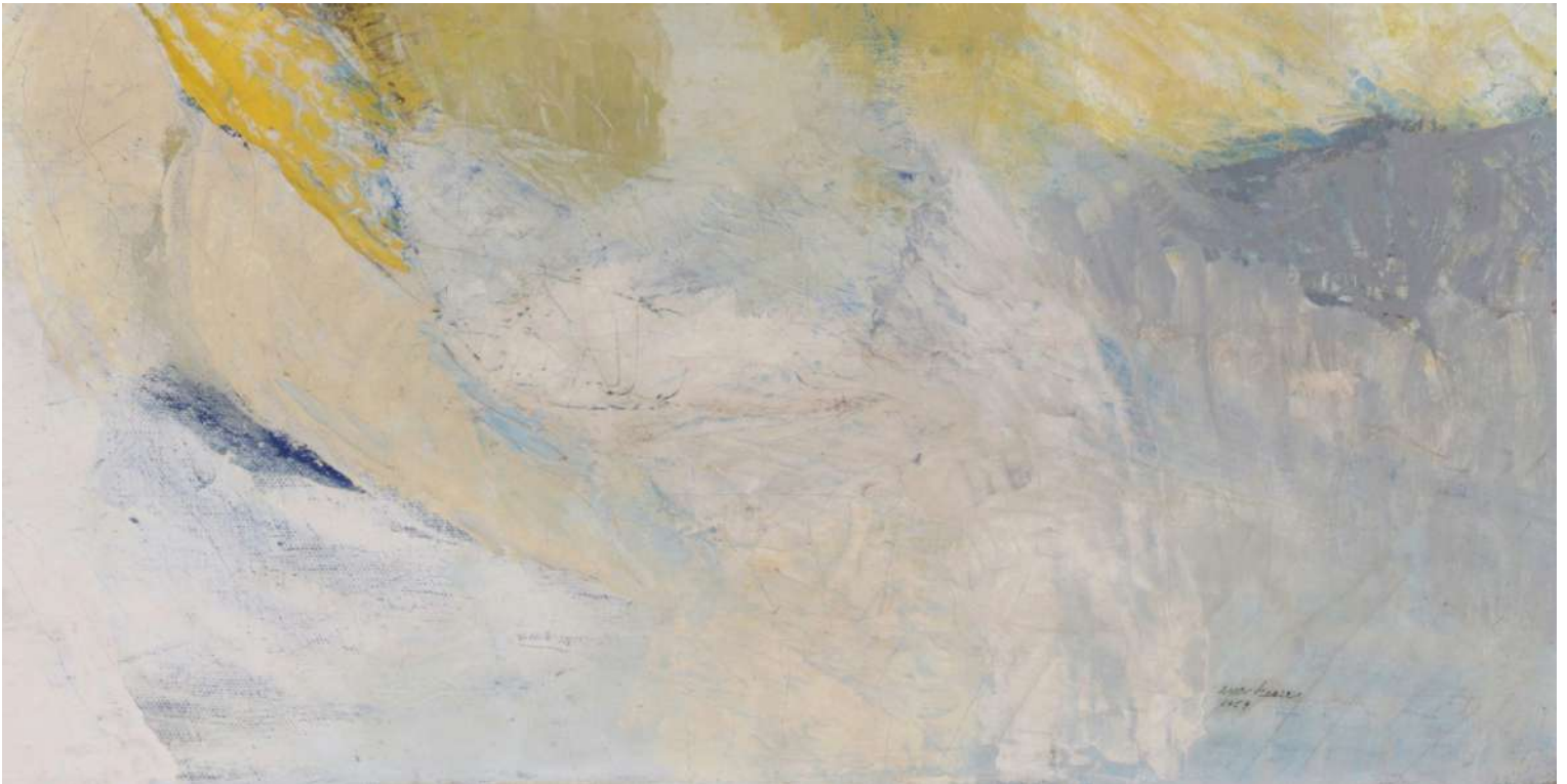
LR corner, after treatment