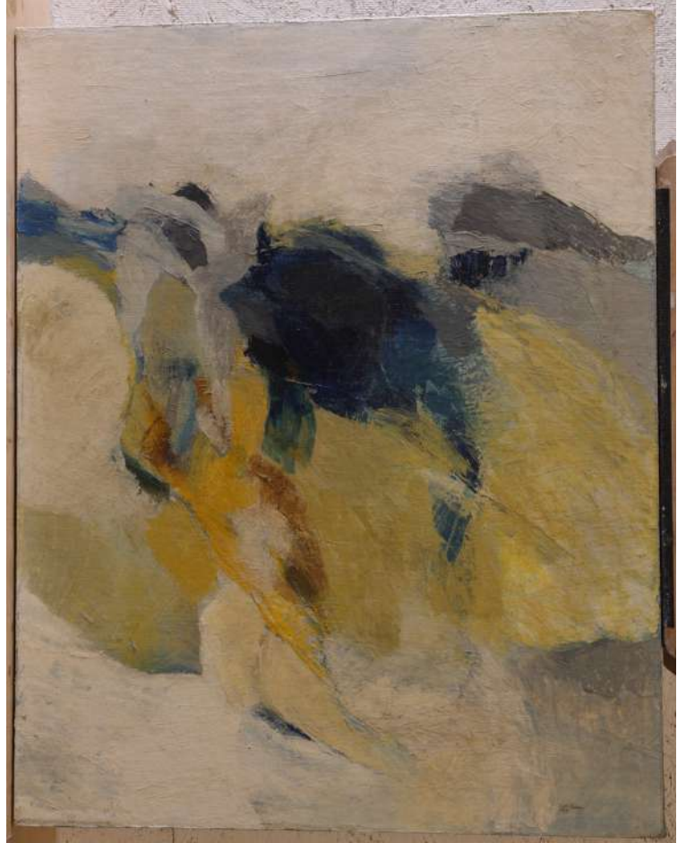
Overall, raking light, after treatment