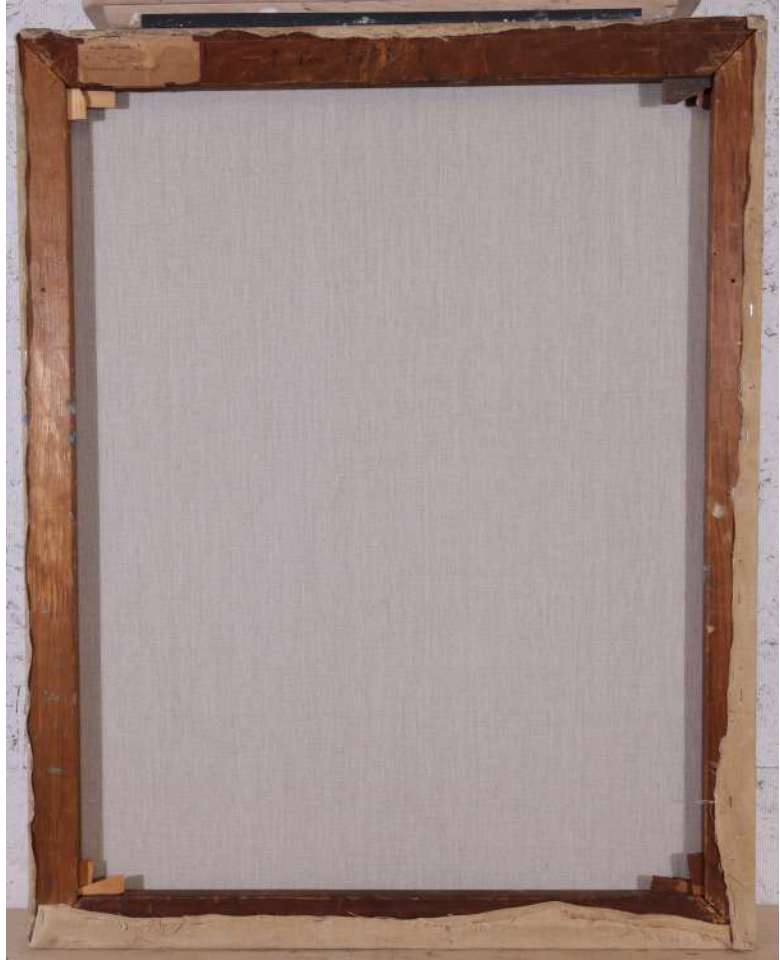
Verso, after treatment