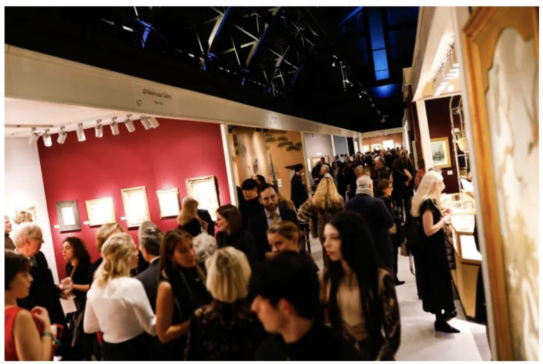
Held annually at the Park Avenue Armory, The Winter Show showcases a breadth of works spanning 5,000 years.

One of this year's standout highlights for antiquities enthusiasts is a gilt wood mummy mask from the Late Dynastic Period (circa 664–32 B.C.), presented by Hixenbaugh Ancient Art. This striking artifact is accompanied by an impressive selection of treasures from ancient Egypt, Greece and Rome. Among them are a Roman marble head of Silenus from the 2nd century A.D., tagged at $150,000, and an elegant Roman marble statue of Aphrodite from the 1st century A.D., available for $250,000.