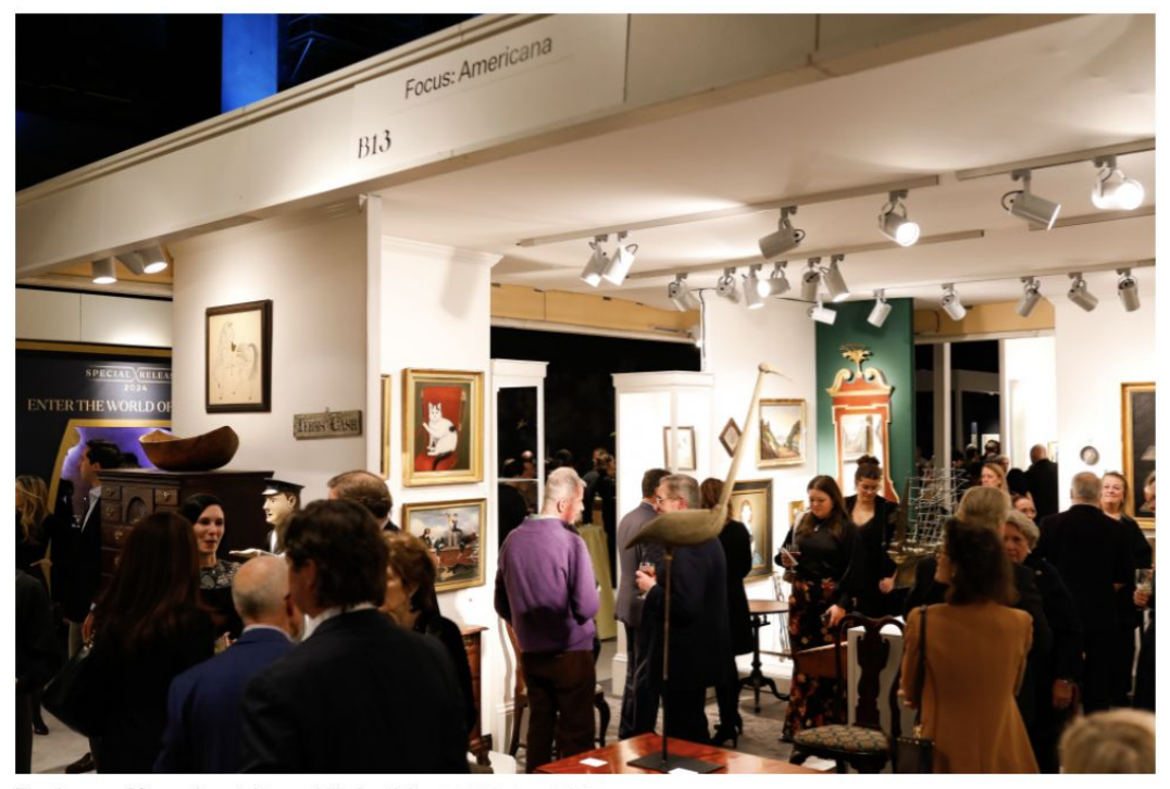
The January 23 opening night was full of activity.