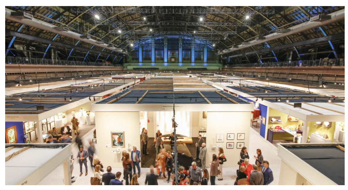
The Winter Show at Park Avenue Armory, New York City

Returning to the Park Avenue Armory for its 71st edition, The Winter Show kicks off New York's art and design calendar with its characteristic blend of past and present.