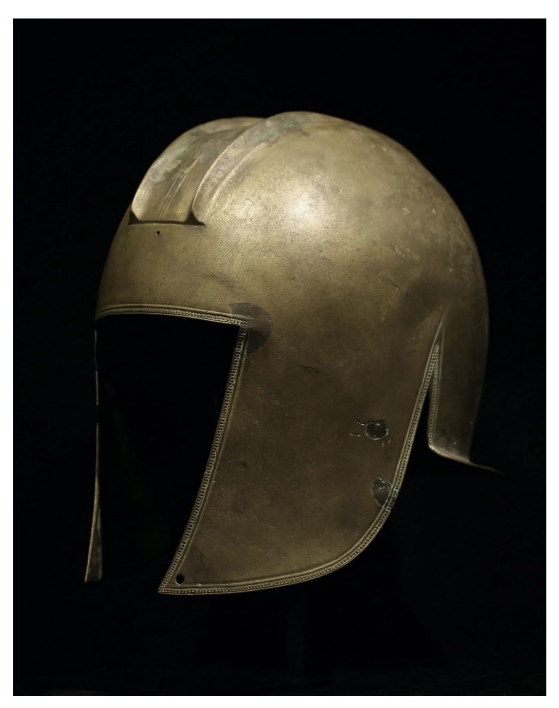
Ancient Greek helmet (500-420 BC) at Hixenbaugh Ancient Art, The Winter Show 2025