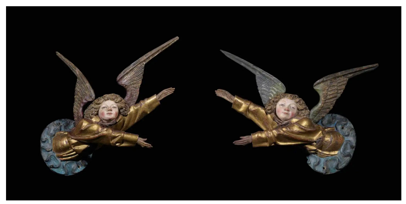
Two Angels From A Coronation Of The Virgin, Germany, circa 1480–1490 at Blumka Gallery, The Winter Show 2025