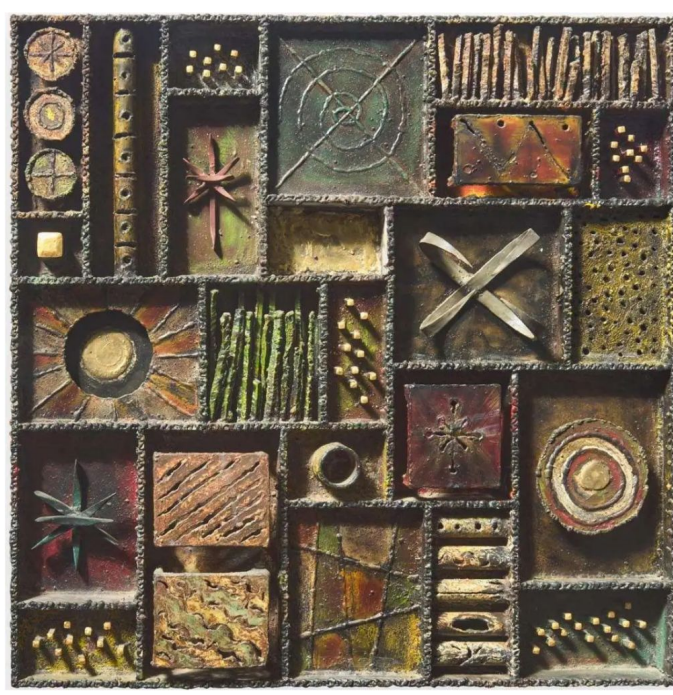
(left) Carved walnut throne chair by Carlo Bugatti, circa 1900. (right) Welded steel wall plaque by Paul Evans, 1972. Both at Milord Antiquités, The Winter Show 2025