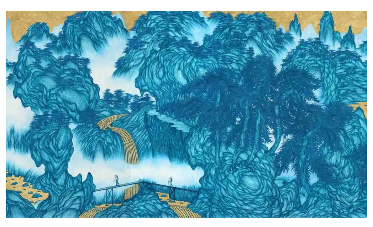
Good Times: Blue Mountain Blue, 2020 by Yao Jui-chung at Michael Goedhuis, The Winter Show 2025