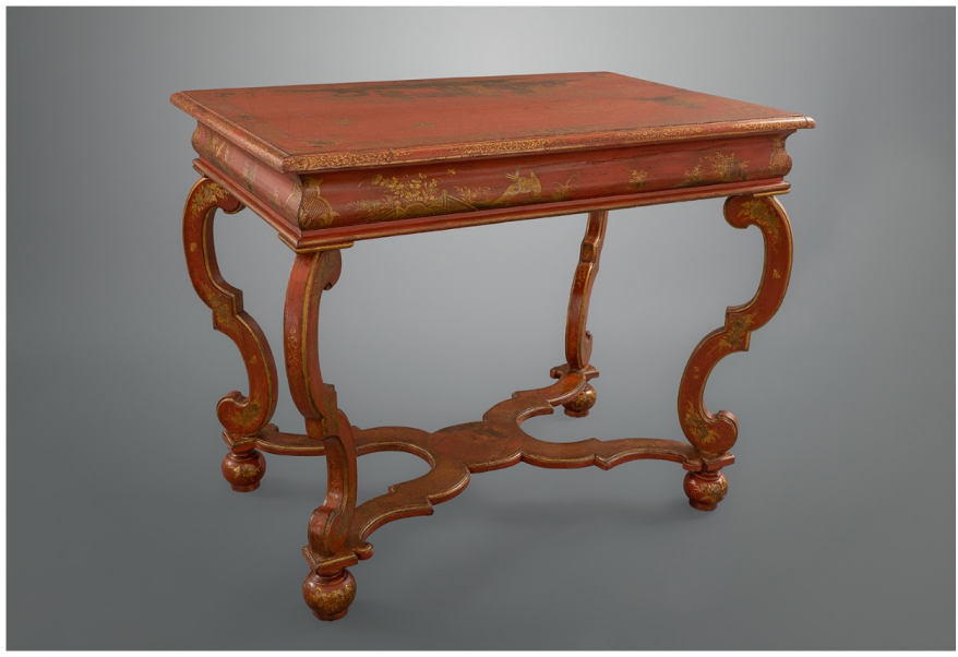
Japanned Center Table, English or Dutch, circa 1675.

Jardins de Bagatelle at Carolle Thibaut-Pomerantz: "This neoclassical depiction of an English garden\ scene\ has\ French\ and\ Chinese\ influences.\ It\ beckons\ the\ viewer\ into\ its\ landscape."