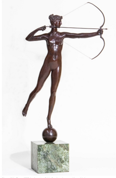
Diana of the Tower, 1899, by Augustus Saint-Gaudens, bronze with marble base, executed at the "E. Great" Foundry, Paris from Lillian Nassau LLC, New York.

Pair of George III antique English silver candelabra at S. J. Shrubsole: "A find like these stately candelabras is something I naturally gravitate towards. Their substantial visual weight and their impressive detailing bring surprising versatility to any surface."