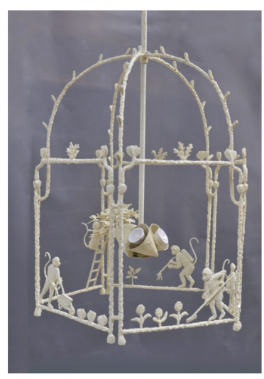
Louis Cane, Lantern of Gardener Monkeys Chandelier, patinated bronze, France, 2010.